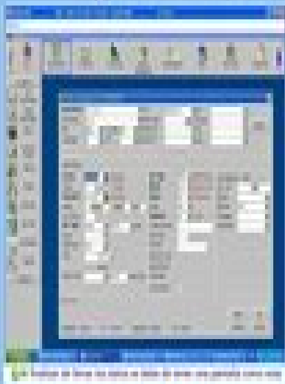
Opera browser information in Opera 10.64 (Build 12101)