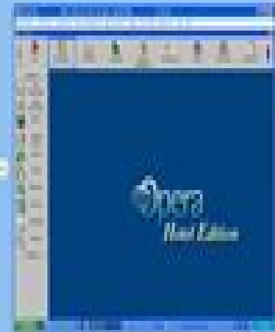
Opera browser splash screen