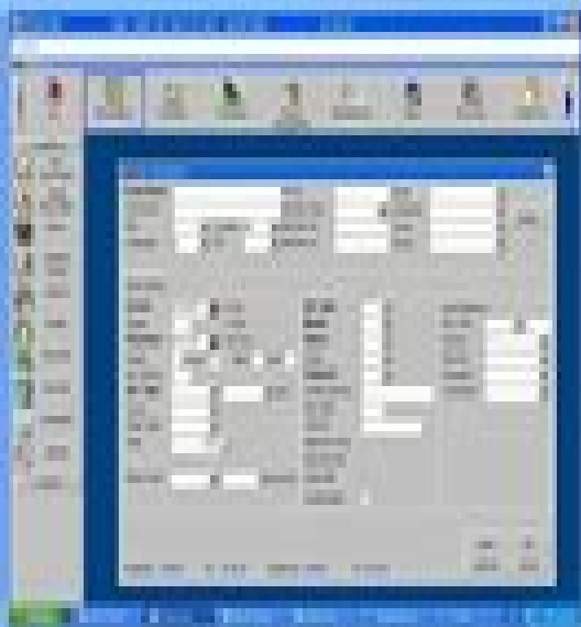
Opera browser splash screen