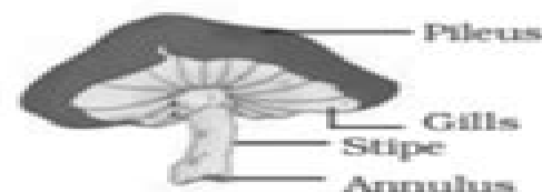
Fig. 2.5 Agaricus