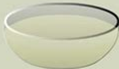
Diluted Hydrochloric acid (HCl)