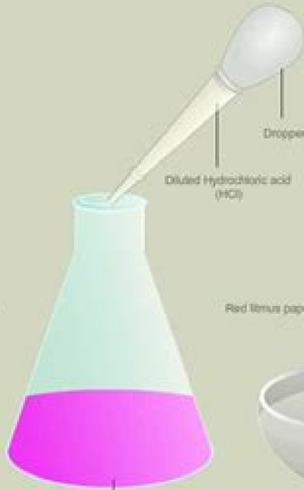
Sodiumhydroxide + Phenolphthalein