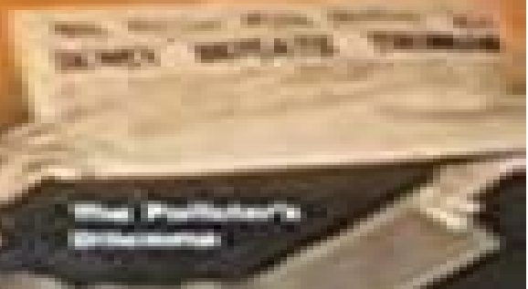
The Pathway to Mathematics