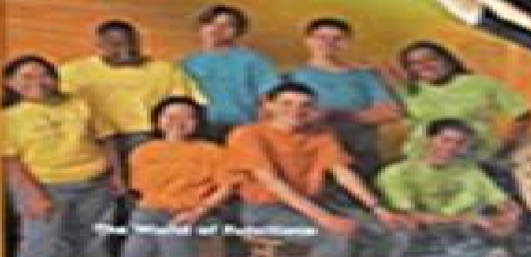
The World of Mathematics