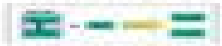
Figure 20.10 Aggregate Demand and Output in a Two-Sector Economy: A Shift in Real GDP

The shift in aggregate demand is a result of an increase in the price level, which leads to a higher level of real GDP. The shift in aggregate demand is a result of an increase in the price level, which leads to a higher level of real GDP.