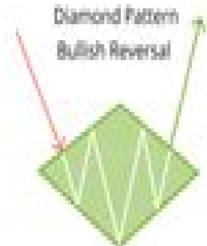
Diamond Pattern Bullish Reversal