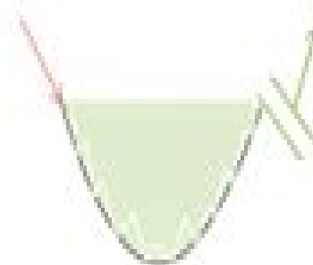
Cup & Handle Bullish Reversal