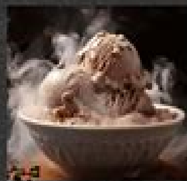
HOT ICE CREAM