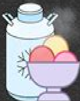
LIQUID NITROGEN ICE CREAM