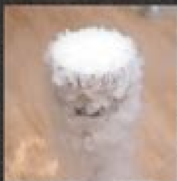
DRY ICE ICE CREAM