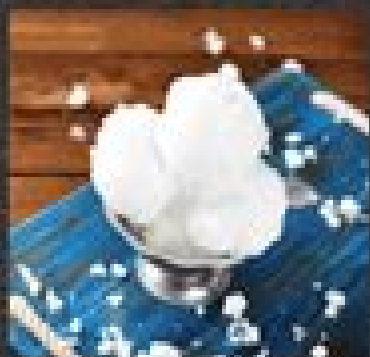
SNOW ICE CREAM