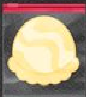
ICE CREAM IN A BAGGIE

Make ice cream using freezing point depression, supercooling, and cryogenics.