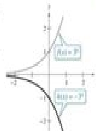
Figure 3.5 Reflection in x -axis