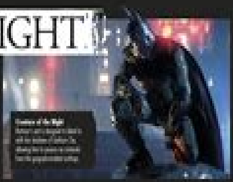
Colors of the Night Batman's appearance is all in shades of black, gray, and blue, a color scheme that is both mysterious and intimidating.

Bruce Wayne decided to dedicate his life to protecting the innocent. However, he was well aware that corruption in Gotham City ran deep and that the police force was corrupt to the bone. Instead of joining the police, instead of joining a criminal and trying to fix whatever wrongs existed in major Gotham and so on. He believed that in Gotham, he had to operate in the shadows. With the most technological resources of the world's top police, he knew he could make a difference.