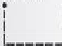
Router Mikrotik CHR