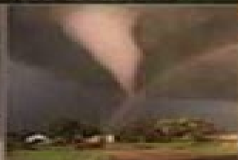
Wonders of the world