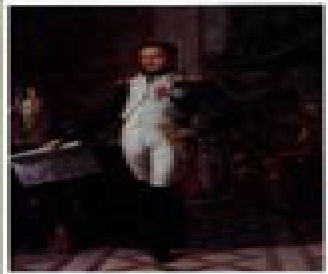
Portrait of young Simón Bolívar, King of Haiti, 1820

Meanwhile, a growing population of mestizo , people of Native American and European descent, and criollo , people of Latin and European descent, were angry at being denied the status, wealth, and power that were available to white, Spanish Americans. They wanted economic control over Spanish colonies. They had recognized the needs of their economies. In the Caribbean region and parts of South America, mines of precious minerals were worked on plantations bought by Spaniards.