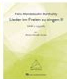
Felix Mendelssohn Bartholdy Lieder im Freien zu singen Vol. 2 HL00392322