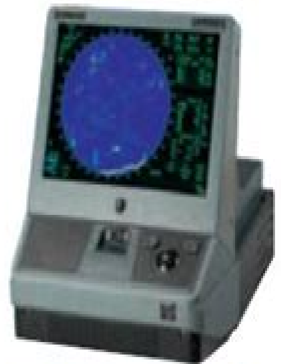
BridgeMaster E 180