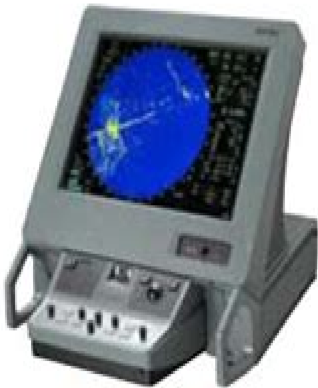
BridgeMaster E 340 Desktop