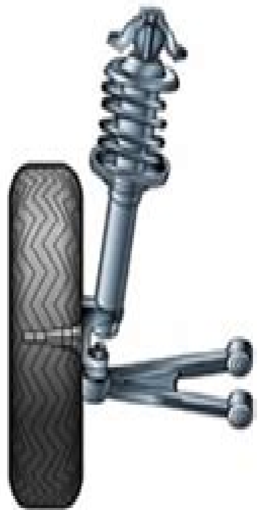
c) Practical suspension