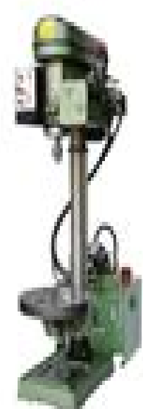
Drill press machine