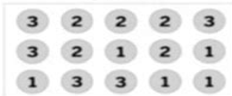
Diagram 1: Bathtub