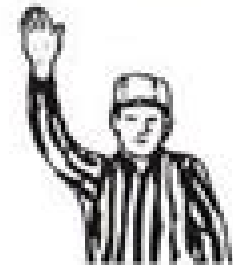
16. Play-On, Dead Ball or Dead Ball Followed by Appropriate Foul Signal