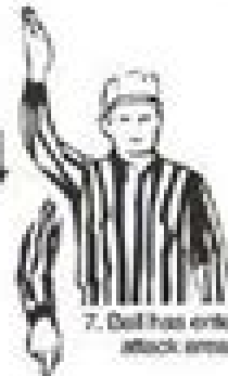
7. Ball has entered attack zone