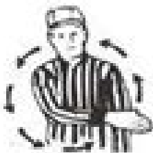
6. Ball in Possession on Face-off and Start the Clock at Half-time