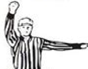
14. Stalling Warning