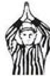
12. Non-Retreatable Penalty