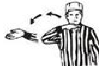
15. Re-entry of the Crease or Illegal Re-entry of the Defensive Zone