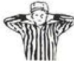
11. Simultaneous Fouls