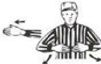
5. Alternate Possession