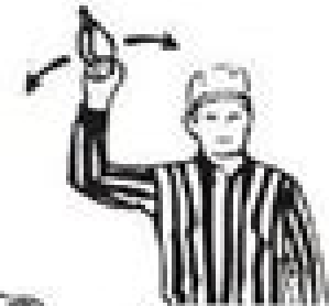
18. Disregard Flag