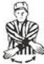
3. No Score