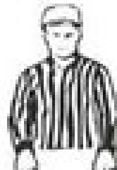
10. Loose Ball