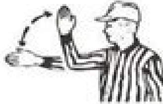
8. Out of Bounds Direction of Play