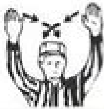
1. Timeout: For Discretionary or Injury Timeout, Follow Signal Above with Tapping of Hands on Chest