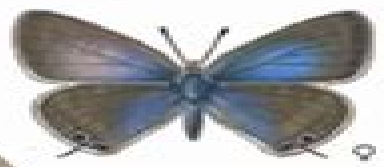
51. Long-tailed Blue Lampides boeticus