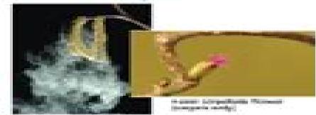
Abiotic Pollination by Wind