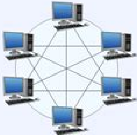
Fully Connected Network Topology