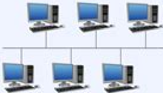
Common Bus Topology