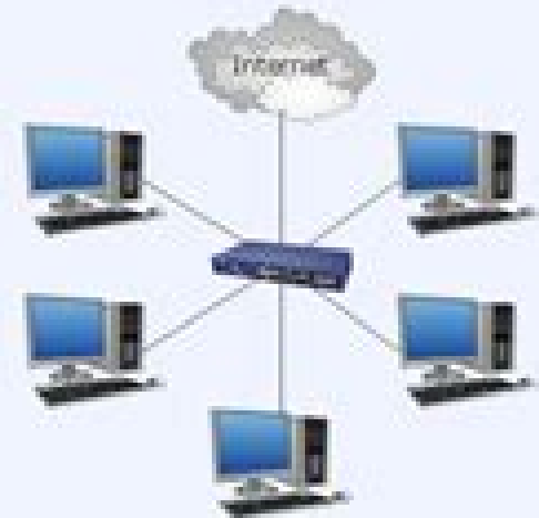
Star Network Topology