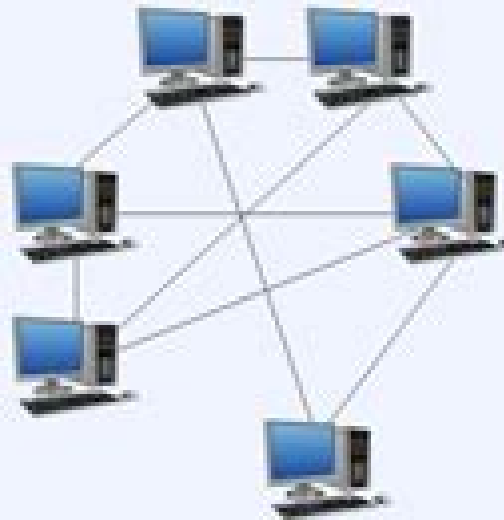
Mesh Network Topology