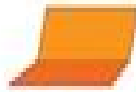
Valley fold represented by a dashed line

To create the mask, you'll need to use two types of simple paper folds: