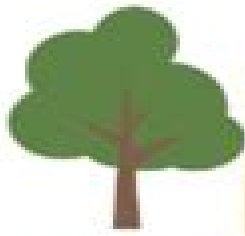
A ÁRVORE tree