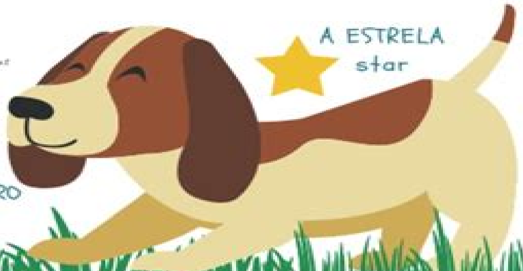
O CACHORRO dog