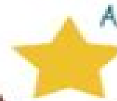
A ESTRELA star