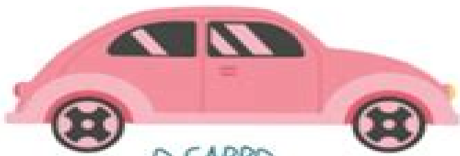
O CARRO car