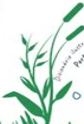
Diagrama ilustrado para crianças Português-English