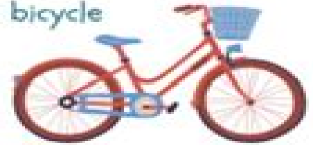
A BICICLETA bicycle