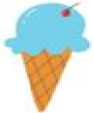
O SORVETE ice cream