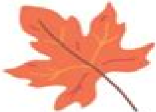
A FOLHA leaf