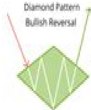
Diamond Pattern Bearish Reversal