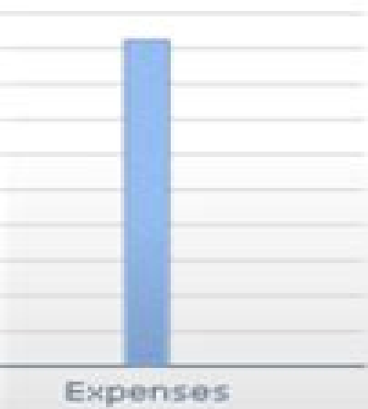
Total Funding by Type Total Funding: $324,048,653