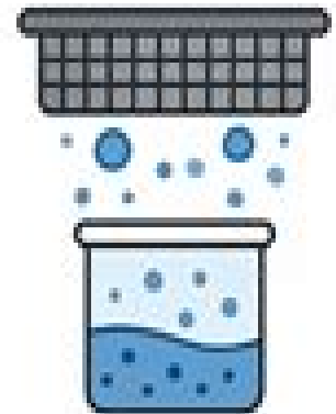
Sieving and Sedimentation