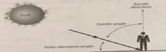
Figure 2-5. Defining angles.

Since we can assume that the Sun's rays strike Earth in straight, parallel paths, we see that the zenith angle of any location is the same as the number of degrees separating the location and the place receiving direct solar rays. Notice in Figure 2-6 that the zenith angle A at 40^\circ N is the same as the latitude difference between 40^\circ N and the subsolar point (where the Sun's rays strike directly — 23.5^\circ S here).