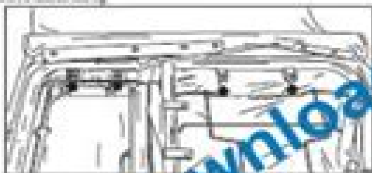
1. front view of front seat body