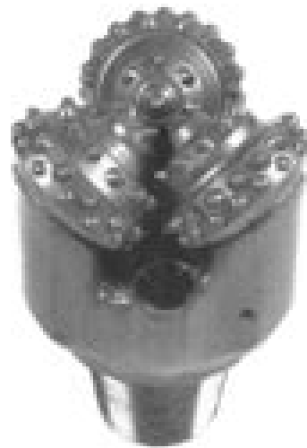
C47 IADC 627