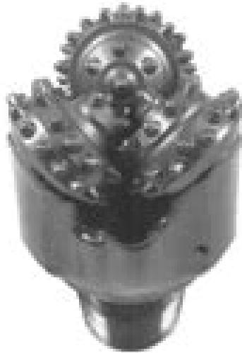
C1 IADC 427