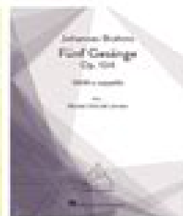
Johannes Brahms Fünf Gesänge/Five Songs Op. 104 HL00373819