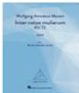
W.A.Mozart Inter natos mulierum HL00373820