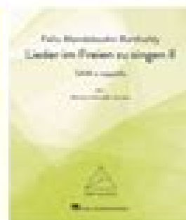
Felix Mendelssohn Lieder im Freien zu singen Vol. 2 HL00392322