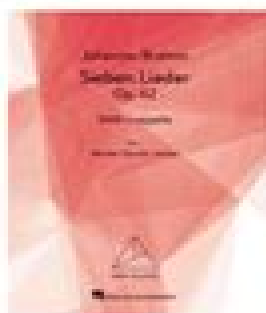
Johannes Brahms Sieben Lieder Op. 62 HL00390944