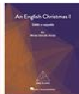
An English Christmas Vol 1 HL00373822