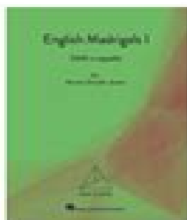
English Madrigals Vol 1 HL00373820