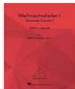
A German Christmas Vol 1 HL00373819