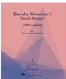
Danish Motets Vol 1 HL00390944