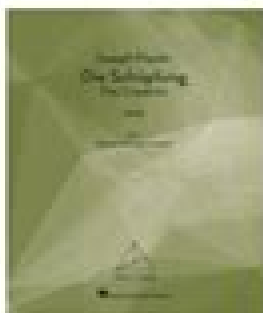
Joseph Haydn The Creation HL00373786