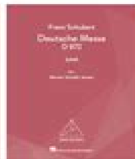
Franz Schubert Deutsche Messe HL00373819