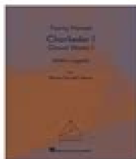
Fanny Hensel Choralieder Vol. 1 HL00373820