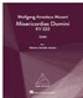
W.A.Mozart Misericordias Domini HL00373821