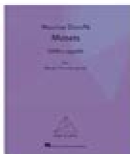
Maurice Durufle Motets HL00373821