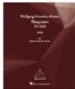
W.A.Mozart Requiem HL00392322