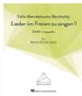
Felix Mendelssohn Bartholdy Lieder im Freien zu singen Vol. 1 HL00373821