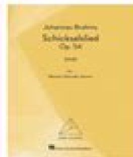
Johannes Brahms Schicksalslied HL00373822