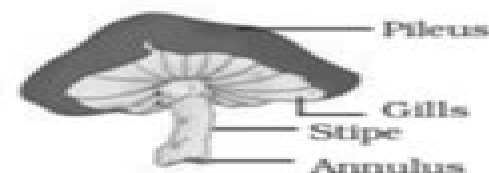
Fig. 2.5 Agaricus