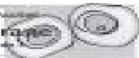
Figure 3.11 Diffusion Through a Membrane

Diffusion is an important process that cells in plants, like cells that are utilized by other organisms, are dependent on. This is because cells, like plants, do not produce by themselves the molecules needed for survival. They must take in molecules of small particles from their environment. However, the cell's cell membrane does not permit particles to move across it at the same rate. Therefore, molecules of small particles are usually distributed unevenly. This distribution is a result of diffusion that occurs over time. In this activity, the distribution of small particles over time is demonstrated using the color dye in the beakers.