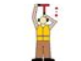
CONNECT TO GROUND POWER