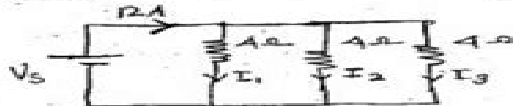
Fig 11 (b) (i)