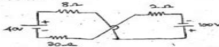
Fig. 11 (a) (i)