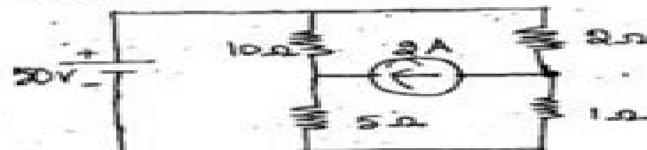
Fig. 12 (a) (i)