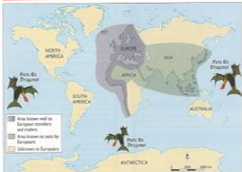
The world known to medieval Europeans