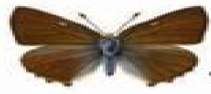
48. Green Hairstreak Collophrys rubi