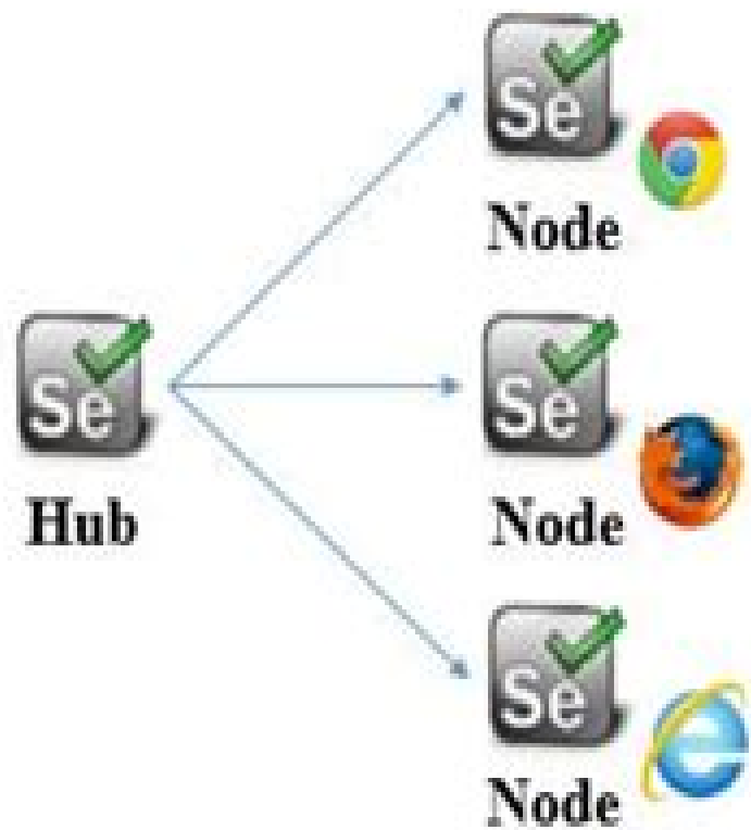
Selenium Grid without Docker