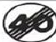
End of speed restriction