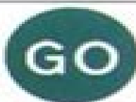
Temporary "Go" sign