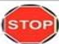
Temporary "Stop" sign