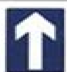
One way traffic