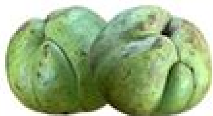
(A) Elephant Apple "Dillenia indica"