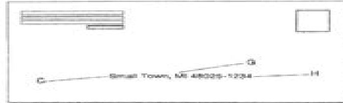
Addressed Envelope 2