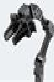
OpenManipulator robotic arm