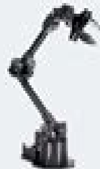
Interbotix Robotic Arm