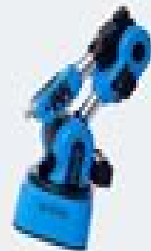
Niryo 6-axis robot arm