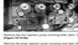
Check the bearing for wear and tear. Replace if necessary.