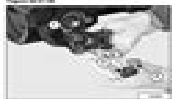
Adjust the bucket height by turning the adjustment screw (1) clockwise or counter-clockwise.

For more information on this procedure, see the "Bucket Height Adjustment" section of the manual.