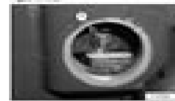
Check the bearing for wear and tear. Replace if necessary.