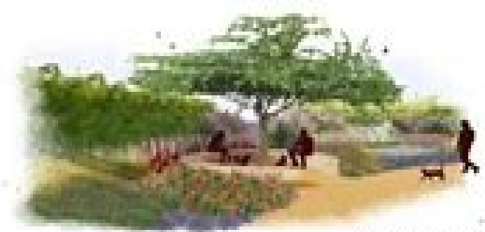
VIEW FROM V1 HUMAN EYE VIEW FROM PATHWAY. VISUAL PERMEABILITY UNDER TREE CANOPY