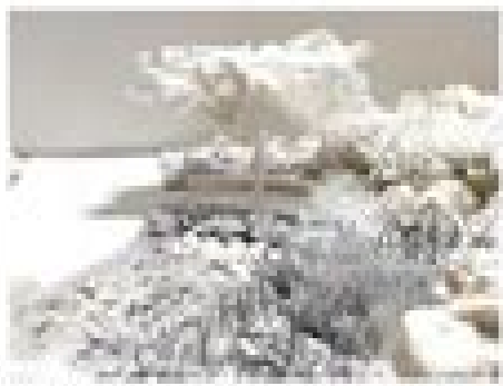
COMPOSITION EXPRESSED THROUGH MODEL