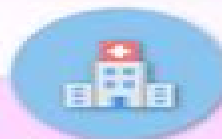
RURAL HEALTH UNIT OR HEALTH CENTER