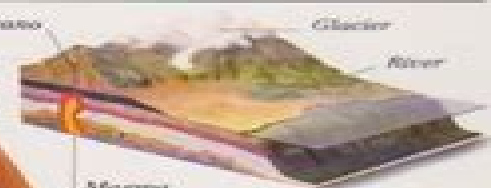
THE ROCK CYCLE