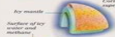
STRUCTURE OF PLUTO