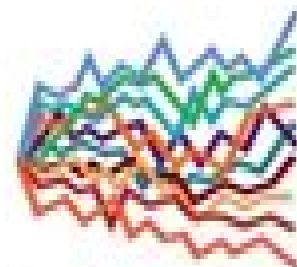
Many Future Scenarios