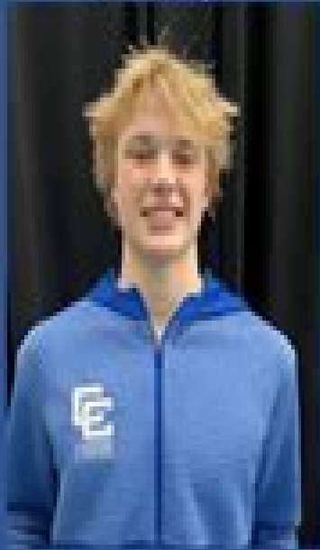
Detroit Catholic Central Lake Mychalowych 1:37.98