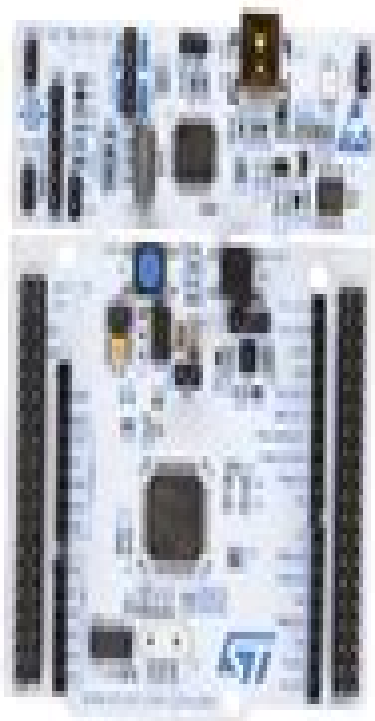
NUCLEO-64 (64-pin MCU)