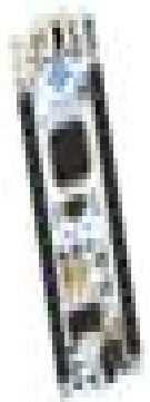
NUCLEO-32 (32-pin MCU)