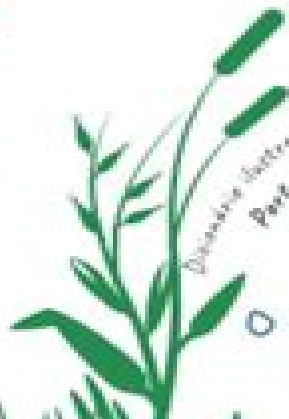
Diagrama ilustrado para crianças Português-English