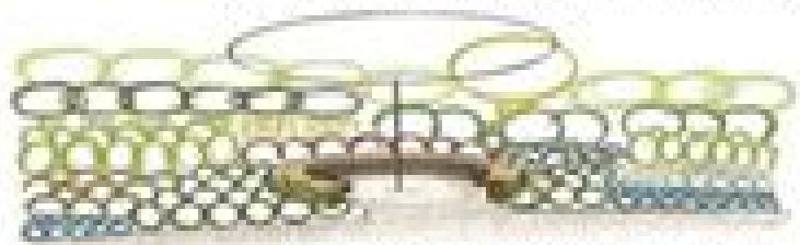
LAYERING SCHEME - COLOURS & VOLUMES