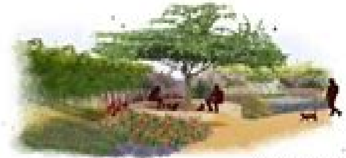
VIEW FROM V1 HUMAN EYE VIEW FROM PATHWAY, VISUAL PERMEABILITY UNDER TREE CANOPY