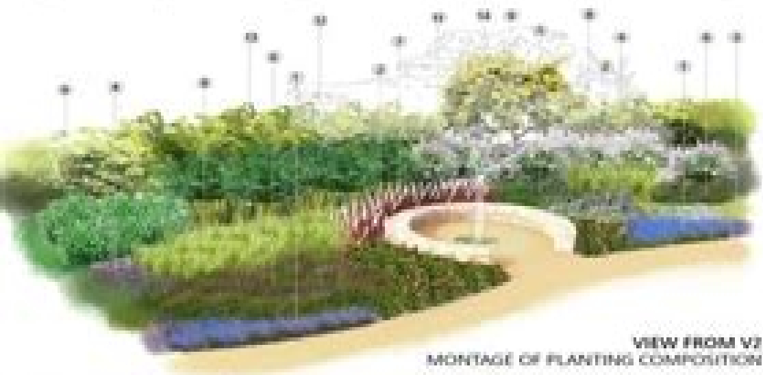
VIEW FROM V2 MONTAGE OF PLANTING COMPOSITION