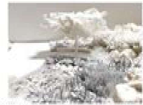
COMPOSITION EXPRESSED THROUGH MODEL